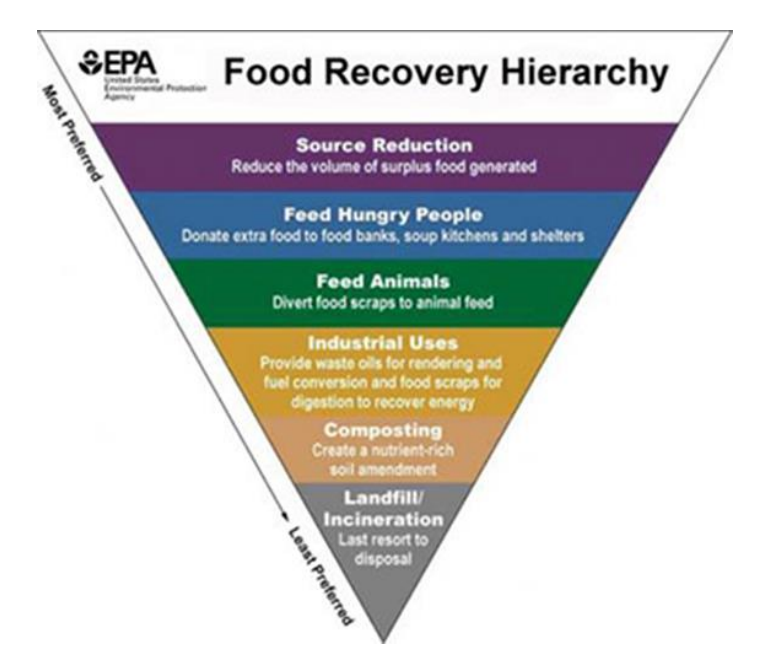
FIGURE 1 – EPA's Food Recovery Hierarchy

The USDA and EPA launched the U.S. Food Waste Challenge in 2013 to begin to assess and disseminate information about the best practices to reduce, recover, and recycle food loss and waste. Some of the techniques emphasized include: